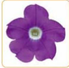
Amethyst Eye 🌱