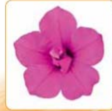
Purple Double 🌱