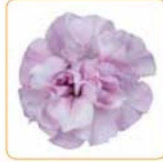
Double Pink 🌱