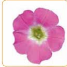
Pink Morn 🌱