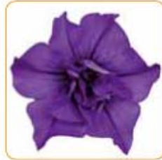
Double Blue Star 🌱