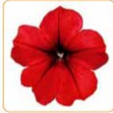
Dark Red 🌱