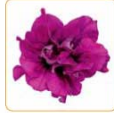
Double Purple 🌱