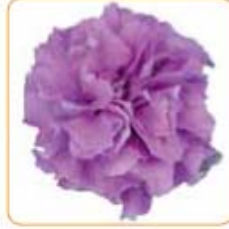
Double Lilac 🌱